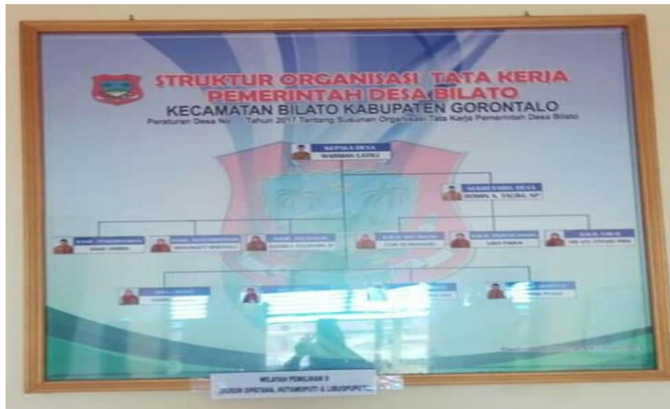
Fig 4. Organizational Structure of Bilato Village Government Institutions; Management of 2020-2025.

Explanation of the Picture of the Organization Structure of the Bilato Village Government Institution above; According to the Regent Regulation Number 234 of 2005 concerning "Job Description and Administration of Village Administration in Bilato Village, it is stated that the sub-district / Village Organizational Structure consists of the head of village / Village, the Secretary of the sub-district the Government Section, the Service Section, and the Development Section". The head of village and other officials in the sub-district government have heavy and complex main tasks and functions.