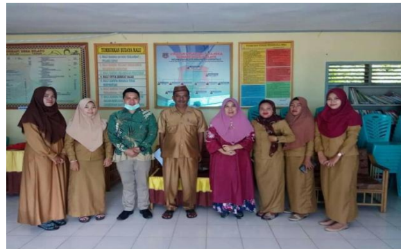
Fig 5. Documentation of activities

1) Giving FGD Materials: Apparatus & Community 2) Photo with the village head and village officials