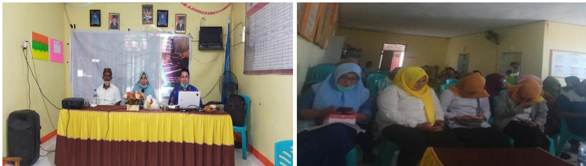
Fig 6. Documentation of Activities

Public services for professional village governments can be realized by the government if there is accountability and responsiveness of service providers, in this case the government apparatus themselves, towards a transparent management for all village communities. One of the most important duties of the Village apparatus is to provide the best possible public services to the community, without being convoluted and not KKN or not prioritizing family and collegials, but prioritizing public interests. Services provided to the community at any time always demand fast, targeted and quality public services, which are carried out in a transparent manner and with accountability reporting. Documentation: administrative management, accountability reporting and financial transparency (online training), teaching village officials to upload village news and teaching people to access village information online.