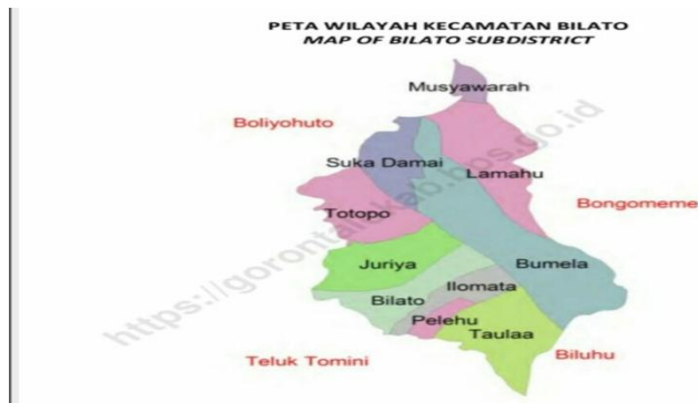
Fig 2. Regional Map of Bilato District

Bilato Village has sufficient marine product potential and diverse economic conditions. High number of residents who do not have permanent jobs (unemployment), but they are supported by the village head, village officials and village communities as human resources in the coastal area, so that they can be provided with hard skills assistance knowledge. Bilato Village is located in Bilato Sub-district, Gorontalo District, Gorontalo Province, which consists of water and land. Bilato Village which borders the North; with Lamahu Village, East and West are bordered by Totopo Village, as well as Bilato District, to the east by Pulubala District, to the west; bordering Boalemo Regency, north of Bebatasan with Boliyohuto District and in the south by Biluhu District, this southern part is a bay with Tomini Bay, as the area of the Togian Islands waters. (see Map).